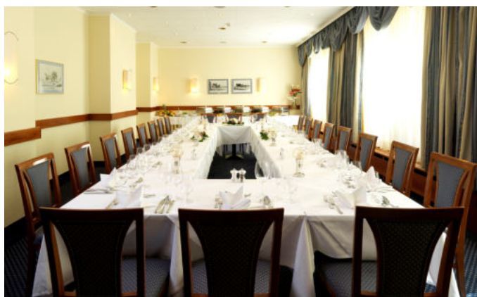
Salon 60m 2